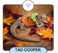
TAD COOPER, BEAN, & AZULA